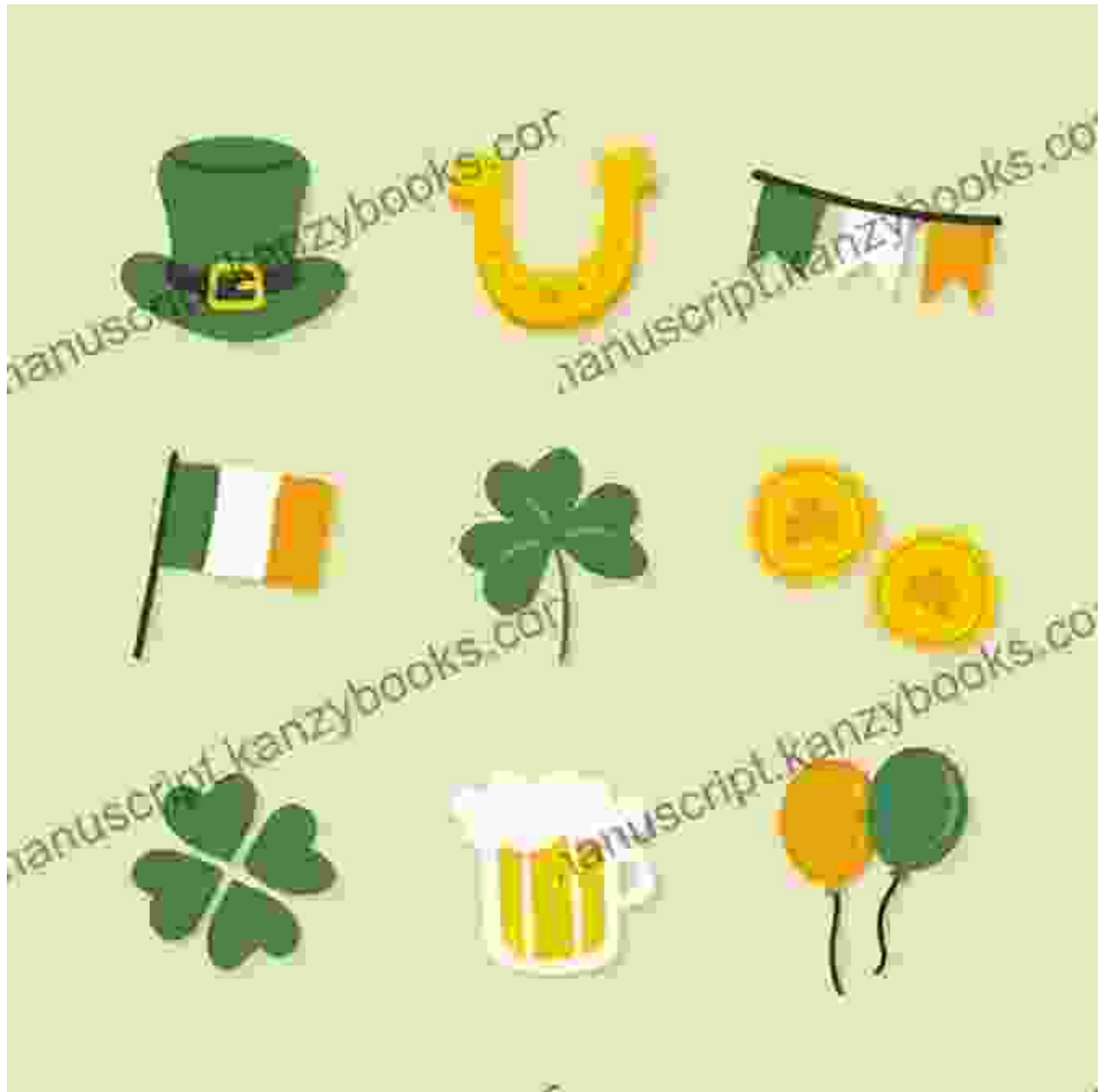
St. Patrick's Day symbols